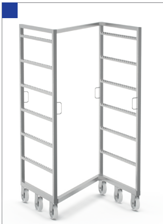
SMOKE HOUSE TROLLEY Z TYPE