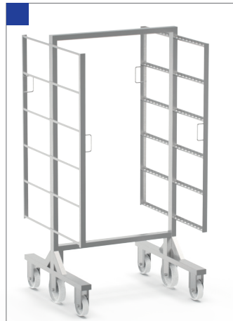
SMOKE HOUSE TROLLEY H TYPE