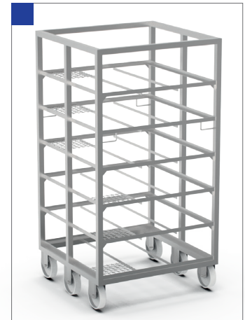
SMOKE HOUSE TROLLEY O TYPE